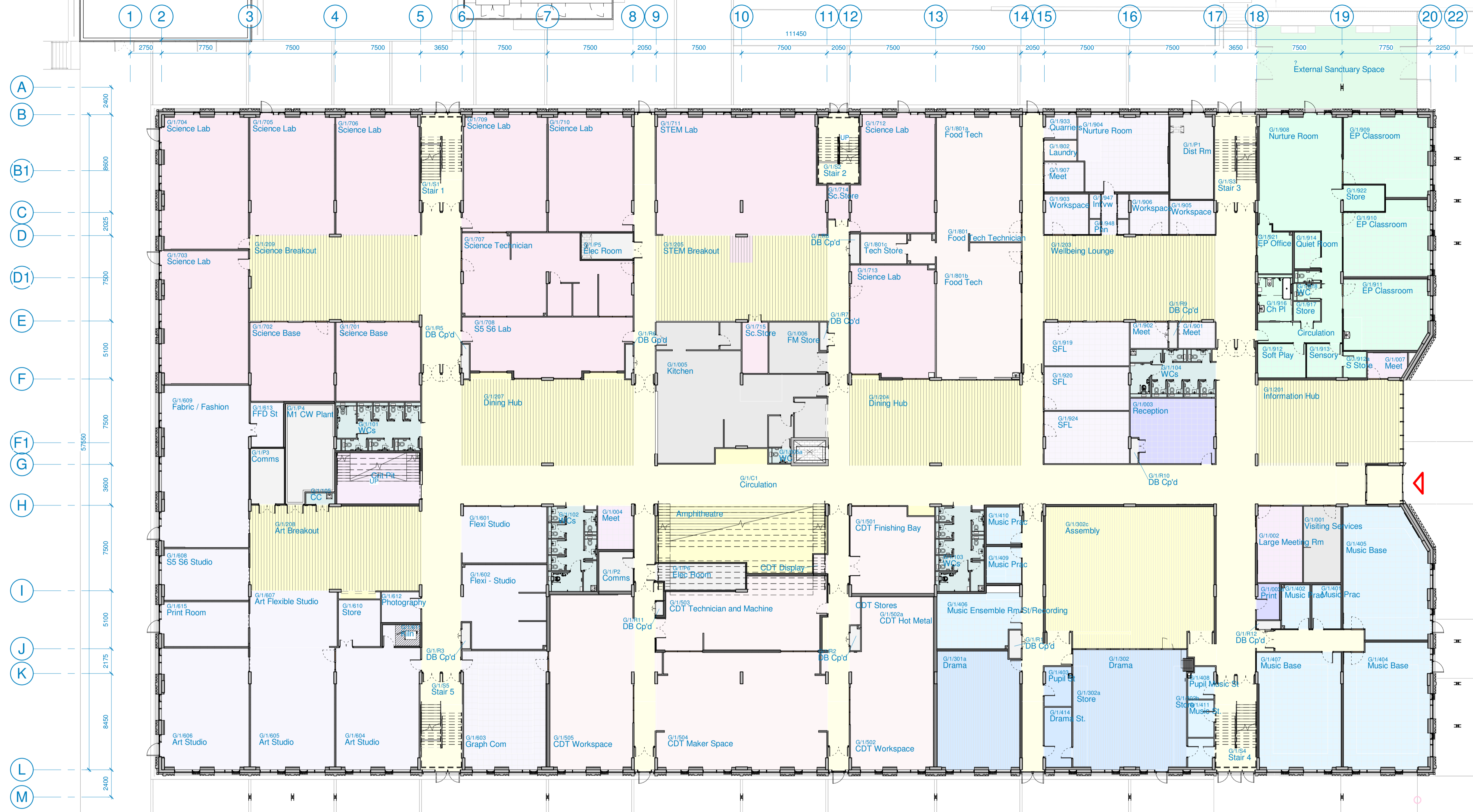
1 Level 0 1 : 200